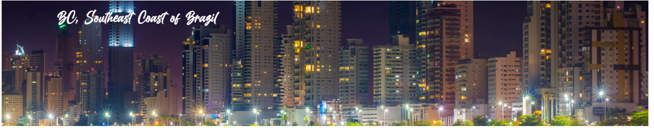
BC, Southeast Coast of Brazil