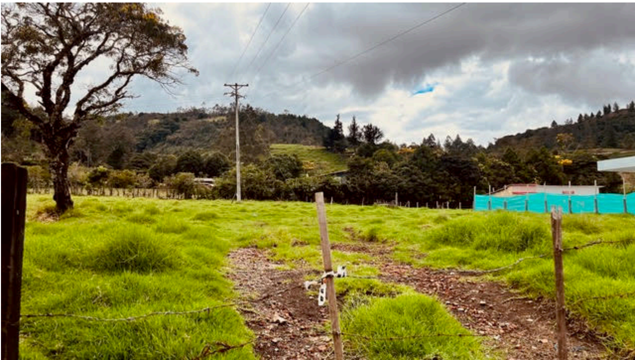
Lot in Nariño, To the right they are building a gas station on the main road to town from the South.