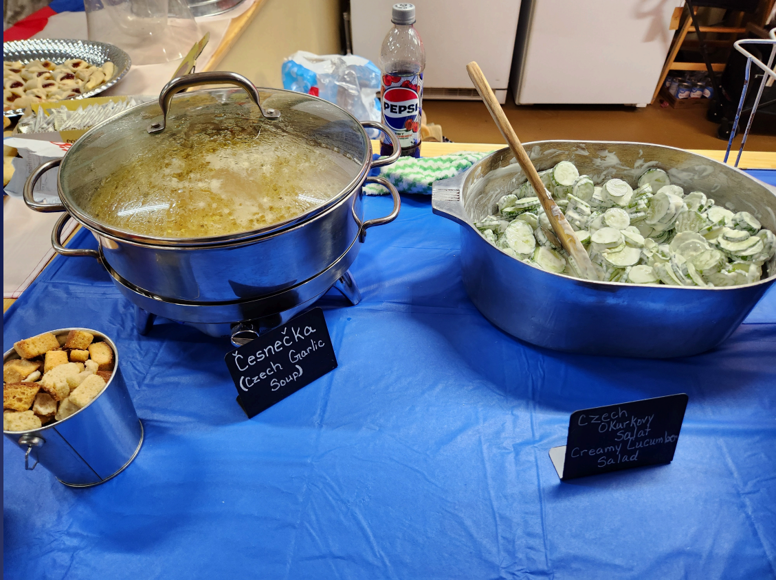
Česnečka (Czech Garlic Soup)