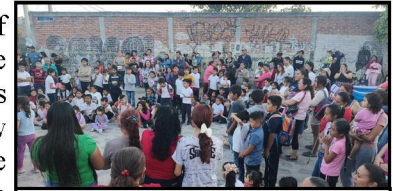
Meeting with 250 in Attendance

God is abundantly blessing our open-air meetings. For our last meeting, I took a vanload of people with me to a needy area of our city. After about an hour and a half of announcing the reunion, 250 people came to attend. Through this ministry we obtain many church prospects, as well as scouting out areas for new routes and churches. Matthew 9:36 states: "But when he saw the multitudes, he was moved with compassion on them, because they fainted, and were scattered abroad, as sheep having no shepherd." Jesus is still moved with compassion when He sees the multitudes with no shepherd!