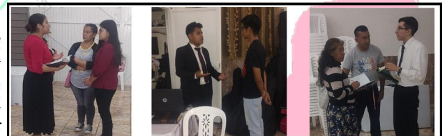
Teens Working at the Altar (My son is on the right.)

In July we will be taking our teens to a youth conference in Mexico City, which is about six hours away from here. I believe this can be a crucial turning point in our churches. The last time we attended this conference, 95 percent of our teens who attended surrendered to full-time Christian service, some of whom are currently in Bible college, or leaving soon for Bible College.