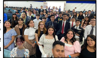
Our Youth Conference Group

After several weeks of praying and raising money, we took a group of thirty-six people to Youth Conference in Mexico City. We thank all of you who contributed. We had new teens and teens who have been attending our church since childhood. Some of these young people will be leaving our youth group this fall to attend Bible College. What a joy it is to see the open-heartedness of these youth! They all made decisions for Christ.