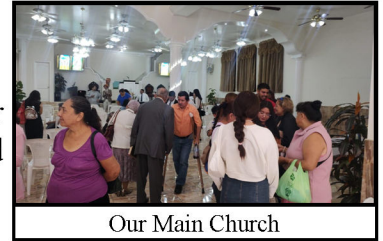
Our Main Church

We would like to share with you the blessings of God upon our ministries. Our churches are doing well. We have had hundreds saved in our open air meetings. And our Christian school is in it's fall semester. May Christ be magnified