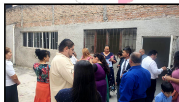
Our 2nd Church