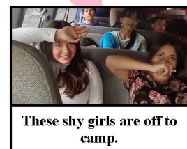
These shy girls are off to camp.