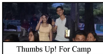
Thumbs Up! For Camp