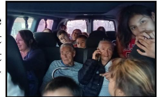
Route for our 2nd Church

We have been focusing some more on our second church which I pastor. It is located in the mountains about 20 minutes from our first church. One might think that being in the mountains that the people are sparse or live on ranches, but such is not the case. It is a very inner city area. What actually happened is the city grew over the mountain. We hold services there on Wednesday evenings, and we use lanterns since our building there does not have electricity.