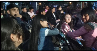
Some of our Young People Enjoying Camp Preaching

One of the pastors here in our state held a special teen camp. We took our youth group to hear some challenging preaching, participate in amazing competitions, and as always — to enjoy the camp food! Of course it rained cats and dogs every day, and our kids returned full of mud and vigor to serve God! My whole family accompanied the youth group, and it was truly a memorial experience. We are helping them to fulfill the decisions that they made with opportunities for service here in the church.