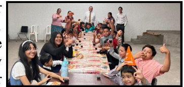
Route Rider Activity

We are trying something new. We had a special day for some of the young people from our routes. They stayed all day one Sunday from our morning service until the evening service. Some of our dear members gave their time to help teach them, play games, and feed them. We served them American pizza, and we also took them to the park. It was a great time for my family to connect with some of our bus kids, and to personally show them how their pastor cares for them. We are planning more activities like these with our riders. Please pray for these young people. Many of them depend solely upon us for their spiritual needs.