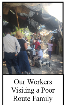
Our Workers Visiting a Poor Route Family