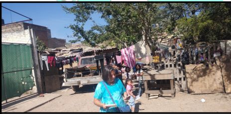
One of Our Workers in a Very Poor Area

We are planning a special Christmas service for December 22nd. We want to bring in many new families to our main church. We will be reaching out to many needy areas with our routes. We will be giving away toys and bags of groceries in the service. We will also be serving a large meal. Our main goal is to bring them in the hear the Gospel. Psalm 41:1, " Blessed is he that considereth the poor: the Lord will deliver him in time of trouble. "