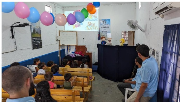
The puppets were a big hit in Nueva Palmira! Here, and in Colonia, the children responded well to the lessons.