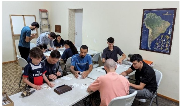
We write, print, and fold our own tracts for distribution in Colonia and the rest of the world ( seminariobc.org ).