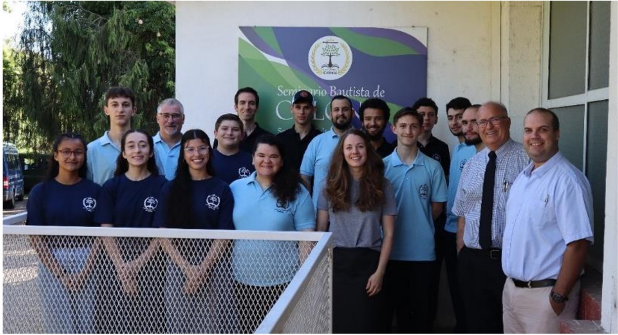
This was our group this summer. The pretty, happy looking girl at center-right made awesome lunches.