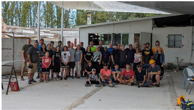
Faith Baptist of Davison, MI, helped us build a Fellowship Hall.