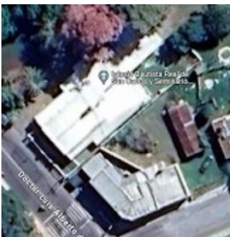
Google Maps Screenshot.png 801K