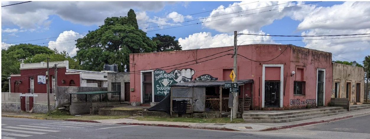
Thank you for your continued prayers for the acquisition of this corner property. Below you will find my sketch of a possible floor plan. The small orange apartments attached behind are not included but could be a future acquisition. Renovation plans would include new matching doors for the seminary and this building.