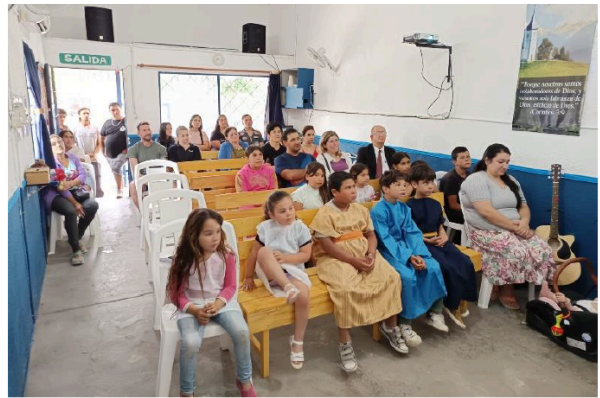
Lots of the parents came and heard a clear presentation of the gospel.