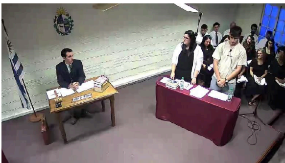
I was asked to play the judge in “a Son is Given”.